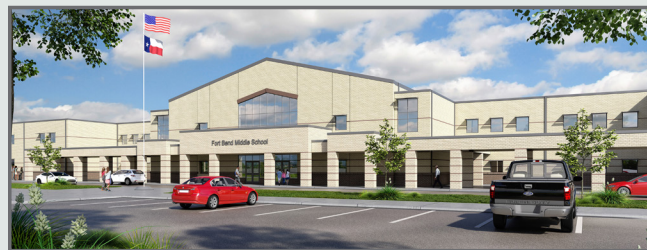
Middle School 15