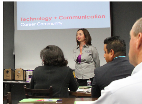
Industry representatives meet to offer feedback on future CTE facility.

Students from all 11 high schools will attend the facility, which will include 21st Century Learning concepts that support collaboration. The facility will service approximately 2,000 students daily through half-day programs. Plans also include five student-run enterprise businesses that will be open to the community, such as a full-service restaurant and credit union.